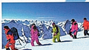
H (HIGH VISION)